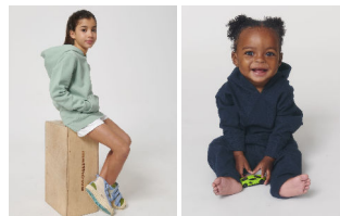
Mini Cruiser Baby Cruiser