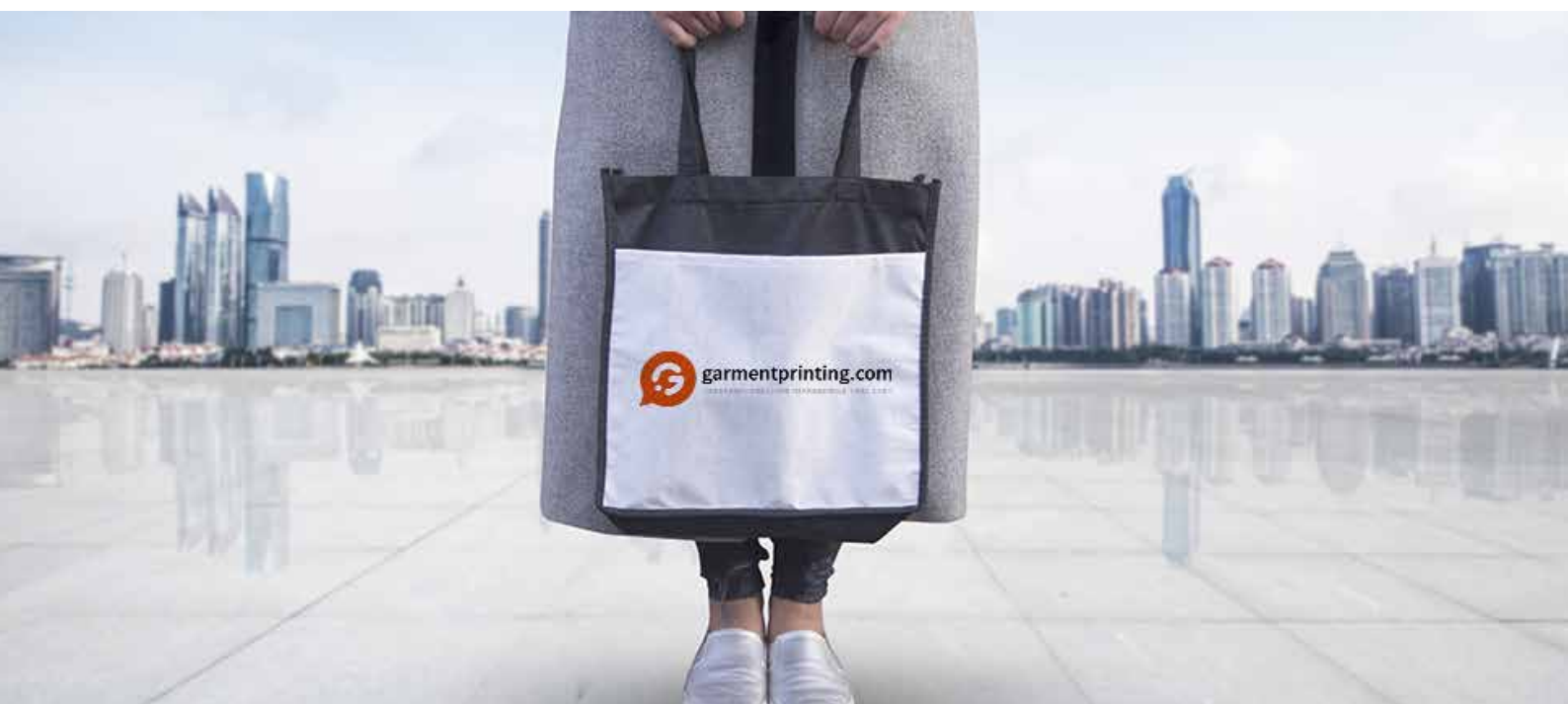
IMAGE TOTE BAG PLUS