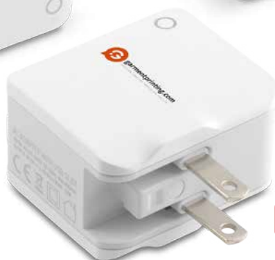
Integrated US & China pin adapters